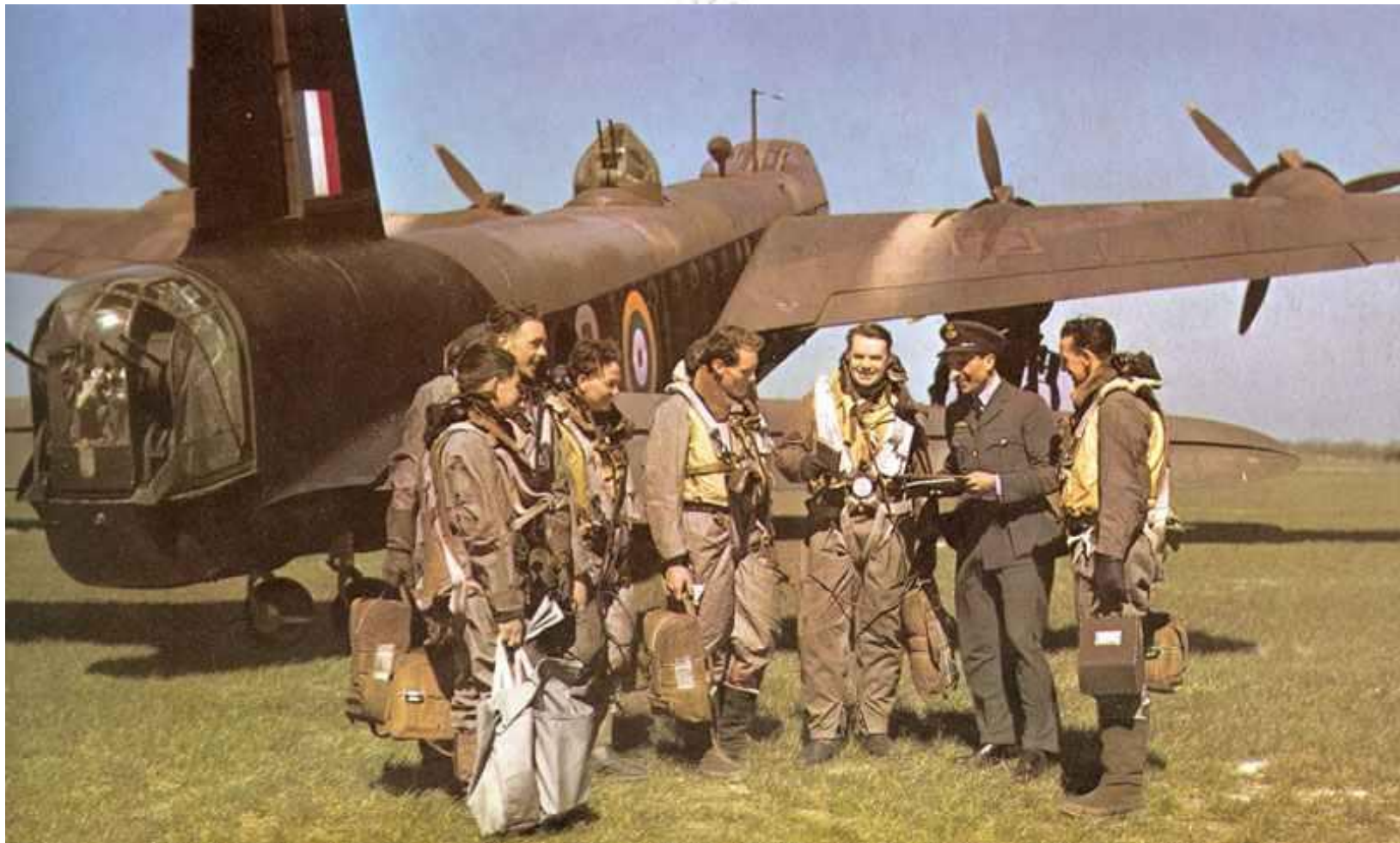
Briefing for the crew of a heavy Stirling bomber of the RAF Bomber Command. Source unknown.